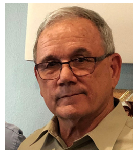
De Ron Jones Club Championship